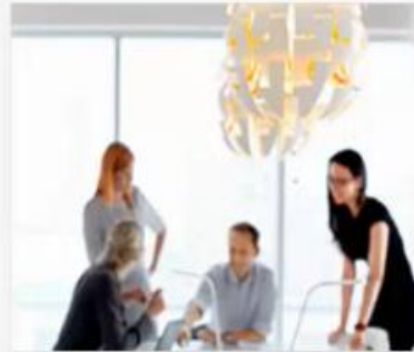
Consultancy & Advisory Services