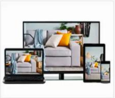
IT Products & Services