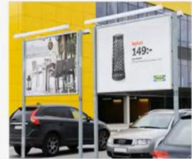
Marketing & Communications